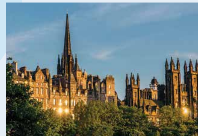
Edinburgh Theological Seminary

With a 2024 Ambassadors matching grant, Edinburgh Theological Seminary can hire a director of training for their new minister-in-training program. The director will provide organizational oversight, spiritual guidance, and pastoral care for the trainees while they participate in various workshops such as preaching, counseling, youth ministry, and church planting. Through your generosity, the Free Church of Scotland now has a way to equip new pastors to lead churches and reach new communities across the United Kingdom.