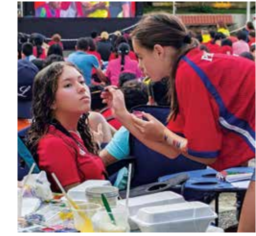
A church member paints the face of a young girl.

"If you trace almost any of the stories of our people, there is some touch point to the park."