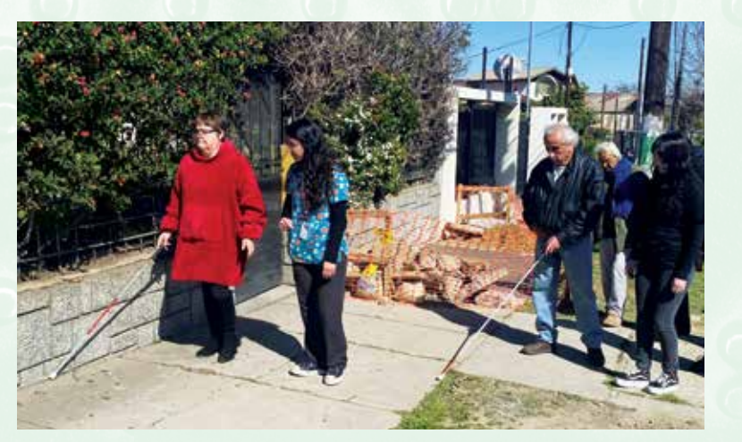
CEMIPRE teaches orientation and mobility, also called cane travel.

Every disability has consequences, so the center works in Jesus' name to reduce the spiritual, emotional, social, and professional consequences of disability that Jesus eliminated in His miracles.