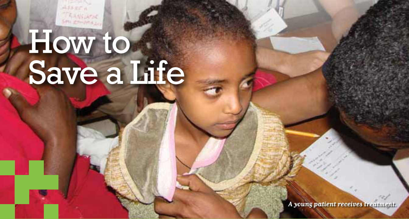
A young patient receives treatment.

“Through this trip I learned just how weak I am spiritually and how much I need Christ to face everything in my life—my marriage, my career.”